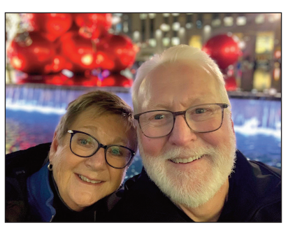
We had a wonderful time with our huge VIP group in New York City - thanks for the memories!